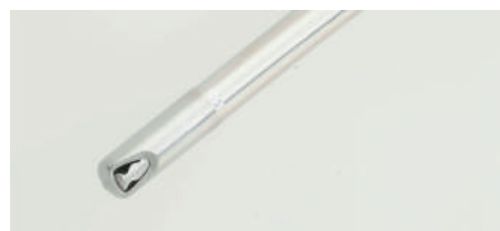
DR SYNOVIA PIT BULL® (three double blades, small window)