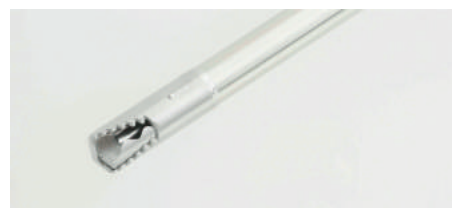
DR WAVE CUTTER® (one double blade)