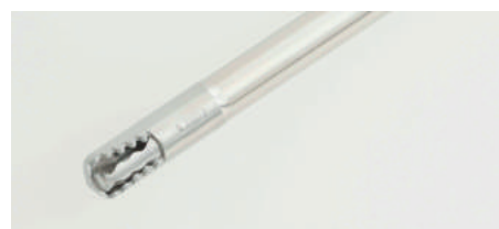
DR PIT BULL® (three double blades, large window)